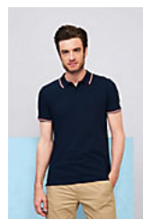
SOL'S PRESTIGE MEN 02949